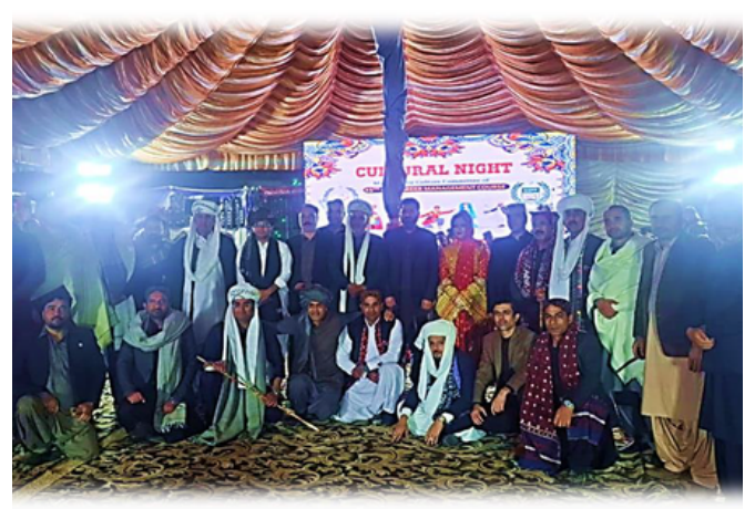
45th Mid-Career Management Course (MCMC) during the Cultural Night NIPA Quetta