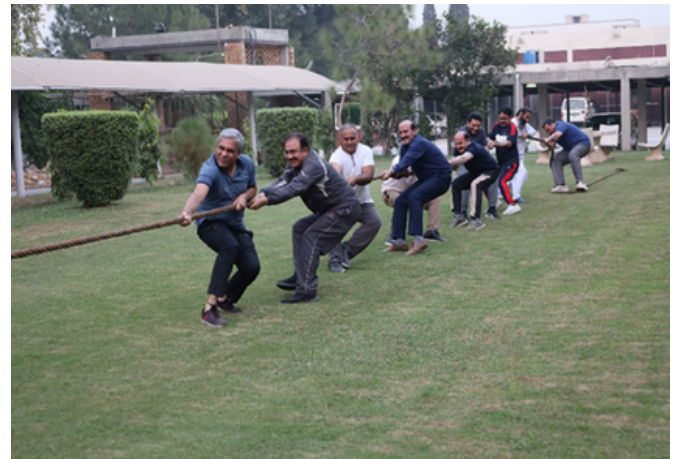
38th Senior Management Course actively engaged in outdoor sports at NIPA Peshawar