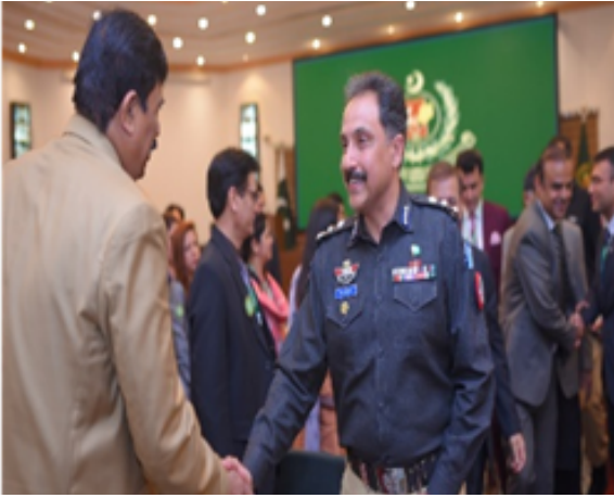
Urban Forest Inauguration & Traffic Awareness NIPA Karachi