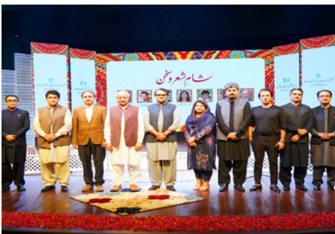
Participants of the 45th MCMC/38th SMC NIPA Islamabad arranged a mushaira