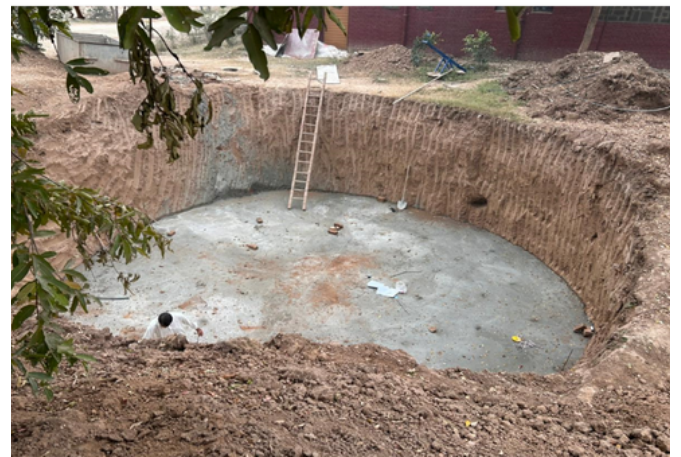
Construction of New Tubewell at Family Park at NIPA Peshawar