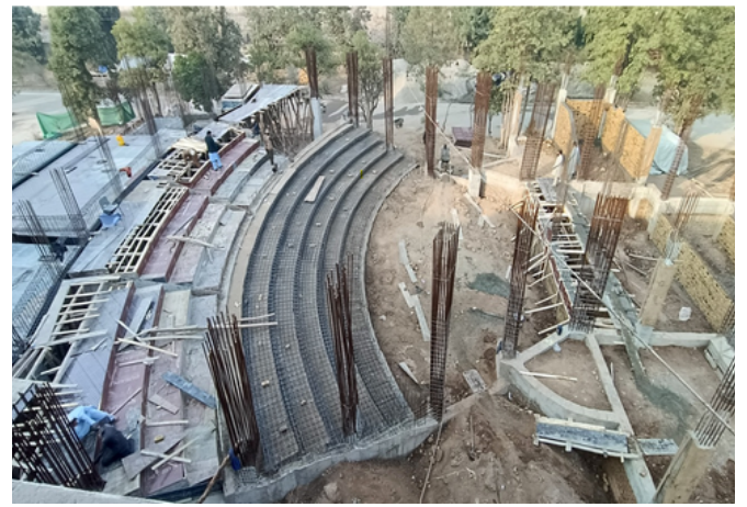
Construction of New Auditorium at NIPA, Peshawar