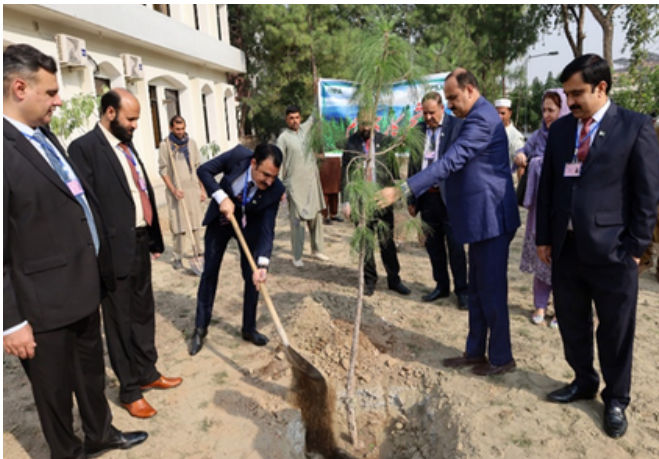
Tree plantation activity conducted at NIPA Peshawar