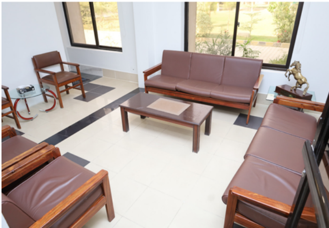
Renovation of MCMC Faculty Lounge & Adjacent Washroom at NIPA Peshawar