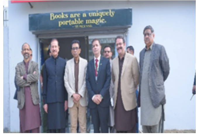
Bookshop Inauguration at NIPA Karachi